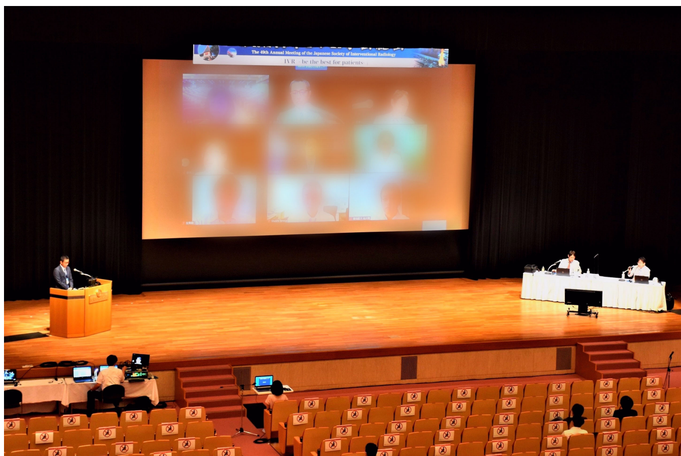
49 th Annual Meeting of the IVR Society of Japan hosted as a hybrid style convention.